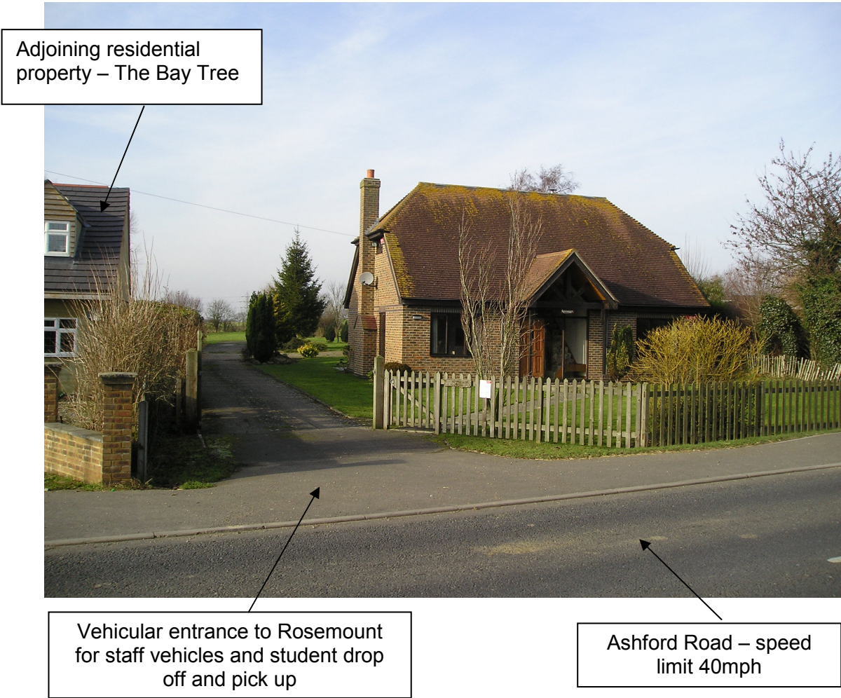
Figure 2 – Proposed vehicle turning circle at Rosemount