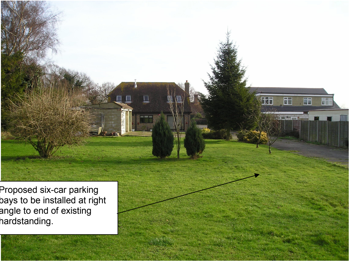
Figure 4 – Proposed car parking at Rosemount

Proposed six-car parking bays to be installed at right angle to end of existing hardstanding.